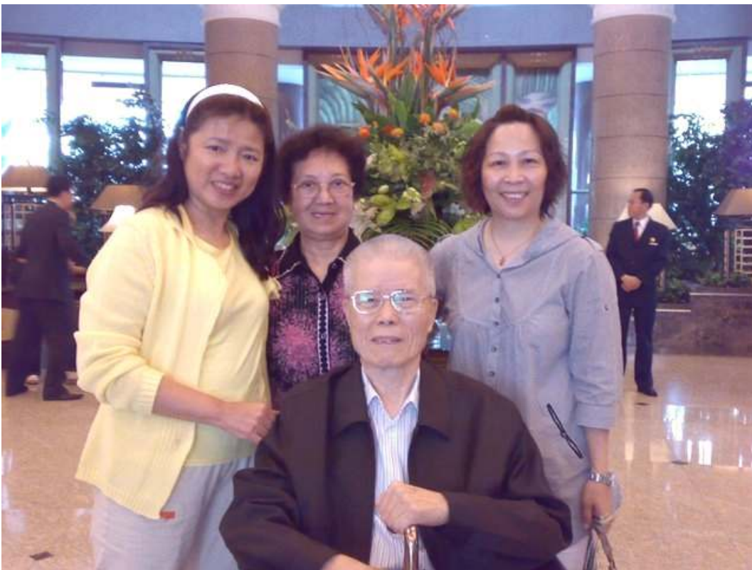
Sen Sir with students inside of Hotel Nikko Hong Kong (2008)