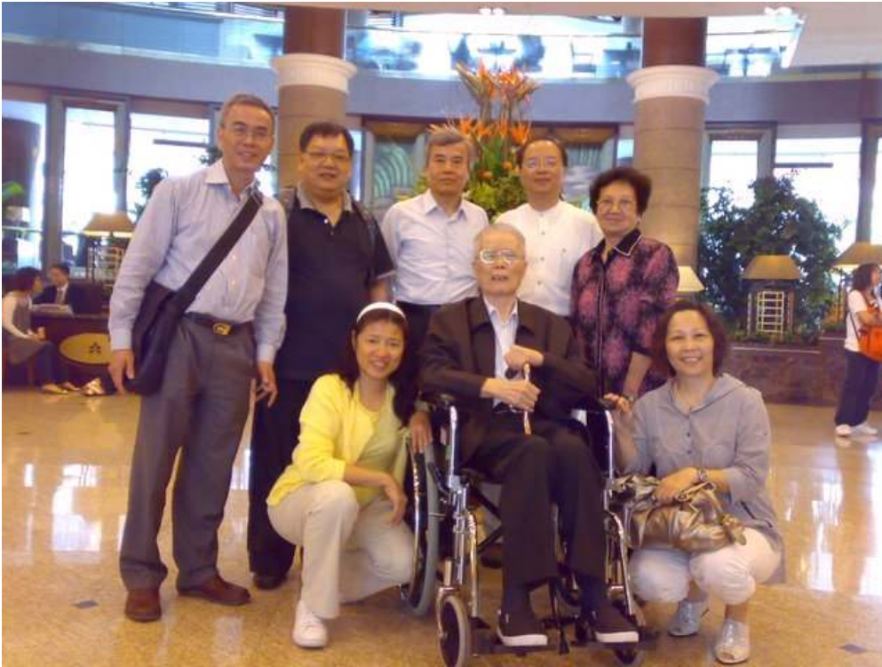
Sen Sir with students inside of Hotel Nikko Hong Kong (2008)