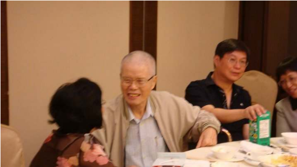
September 2008 reunion (Sen Sir in discussion with a lady)